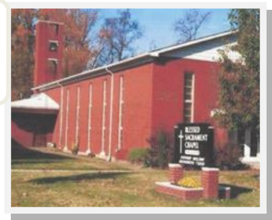
Twenty-ninth Sunday in Ordinary Time October 16, 2016

Gospel — God will secure the rights of the chosen who call out day and night (Luke 18:1-8).