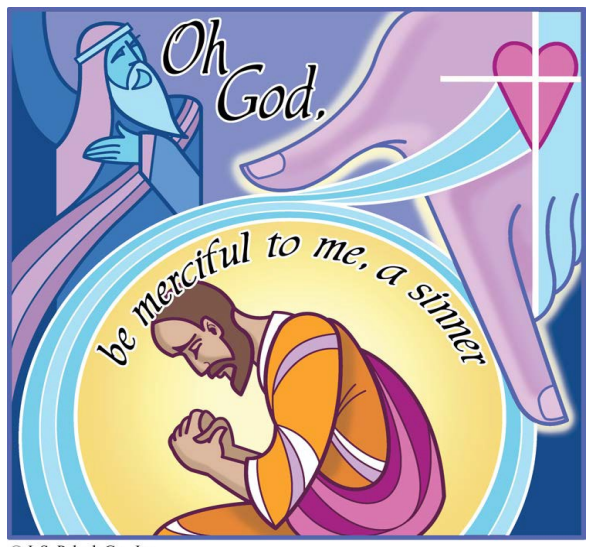
© J. S. Paluch Co., Inc

The prayer of the lowly pierces the clouds; it does not rest until it reaches its goal, nor will it withdraw till the Most High responds.