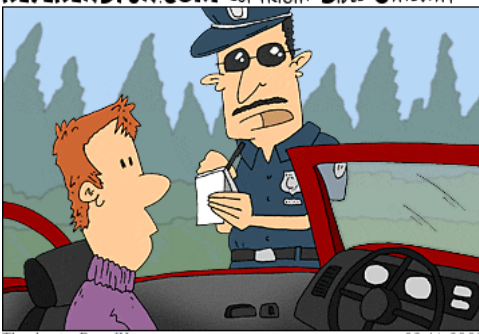
GOD GAVE YOU FREE WILL ... THE CITY