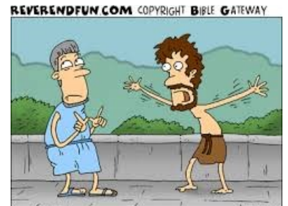
(See Jonah 1-4) 10-04-2010 JONAH ATTEMPTS TO SHARE HIS TALE WITH DOUBTING THOMAS

God, of your goodness give me yourself, for you are enough for me. And only in you do I have everything.