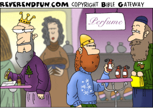
THE WISE MEN, BEING WISE, GOT ALL OF THEIR CHRISTMAS SHOPPING DONE WEEKS BEFORE THE RUSH

We are asked to come away from this festive season ourselves renewed and awake to the presence of God among us. We are asked to find God where God is to be found, to be attentive and surprised and ready to bow down in adoration and to offer our gifts.