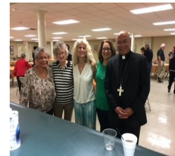
Picture of parishioners who served at reception when Archbishop Fabre visited Owensboro 2019.

Copyright 2003 Karl Zorowski. All rights reserved. www.churchmice.net