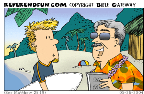
FORTUNATELY, GO YE INTO "ALL THE WORLD" INCLUDES HERE

At the parish meeting last Sunday, decisions were made about the annual picnic which will be August 6th, There will be a drive-through dinner 12-2 pm, Pre-sale Bar-b-q meat and a 50-50 raffle. Please plan to support this in the best way that you can.