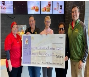
A super thanks to McDonald's for sponsoring a night for Blessed Sacrament Chapel Through their generosity, we received a check for $626..