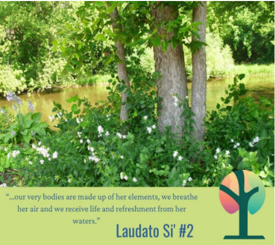
SSND reflection on Laudato Si , Pope Francis's encyclical on Care of the Earth .