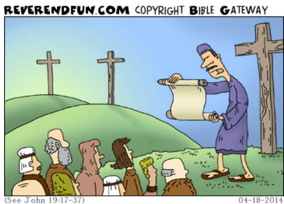
(See John 19:17-37) 04-18-2014

New Math The best mathematical equation I have ever seen: 1 cross + 3 nails = 4-given