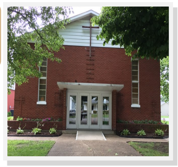
4th Sunday of Easter April 30, 2023

"I am the gate. Whoever enters through me will be saved, and will come in and go out and find pasture." (Jn 10:9)