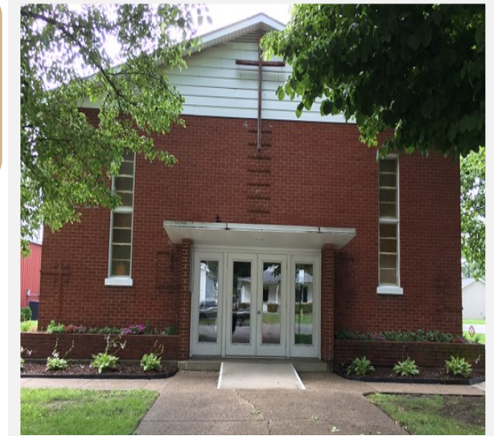
February 9, 2025 5th Sunday Ordinary Time

Excerpts from the Lectionary for Mass ©2001, 1998, 1970 CCD.