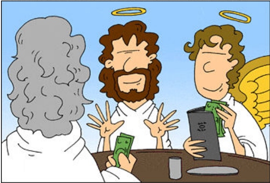
THE SON AND THE HOLY SPIRIT ALWAYS PICK UP THE CHECK ON FATHER'S DAY